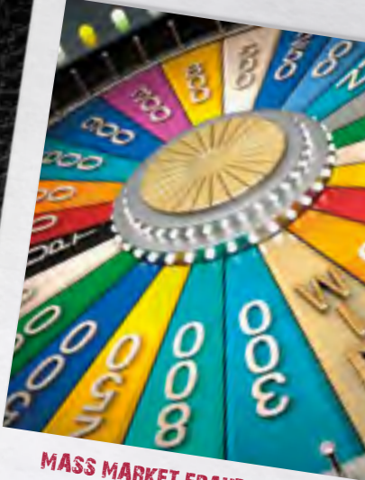
MASS MARKET FRAUD - SCAM MAIL