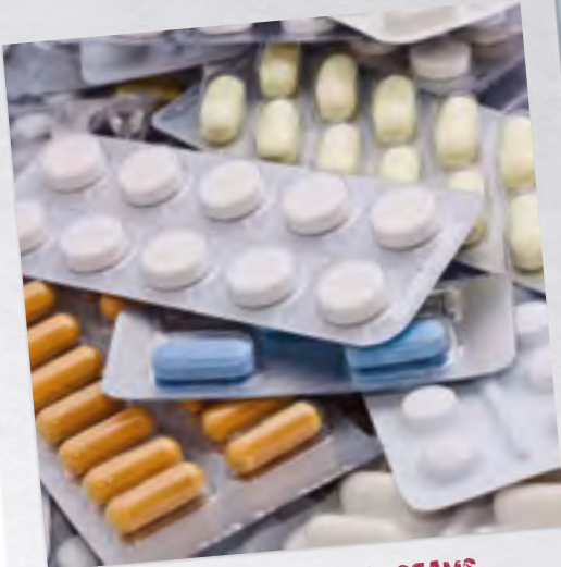
HEALTH AND MEDICAL SCAMS

Try the most powerful weight loss formula