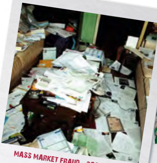
MASS MARKET FRAUD - SCAM MAIL