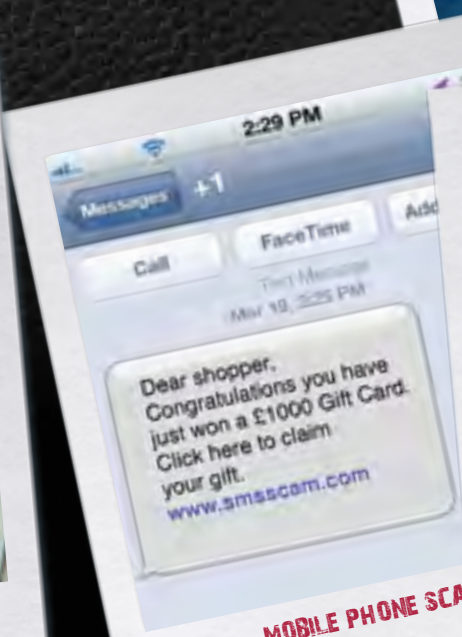
MOBILE PHONE SCAM