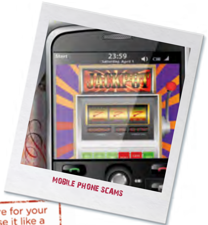
MOBILE PHONE SCAMS