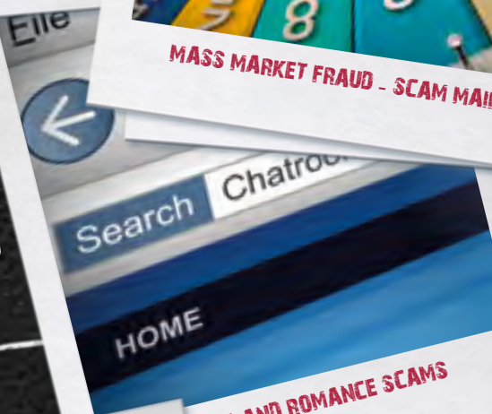
DATING AND ROMANCE SCAMS

JUST REMEMBER: IF IT SOUNDS TOO GOOD TO BE TRUE, IT PROBABLY IS.