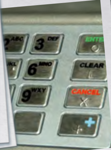
BANKING AND PAYMENT CARD SCAMS