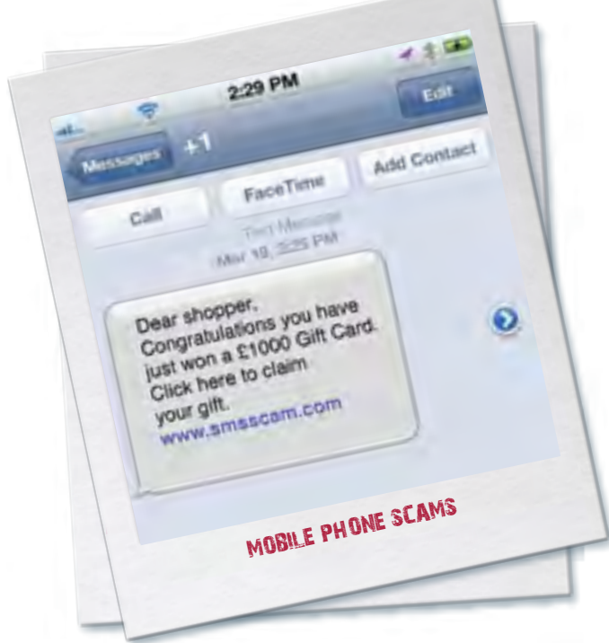
MOBILE PHONE SCAMS